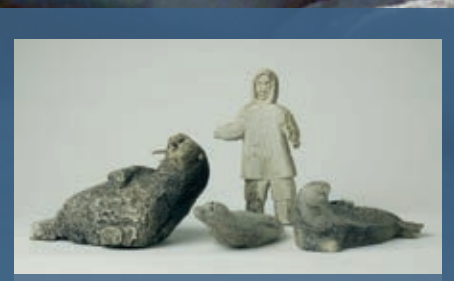
Inuit with animals (material: whalebone),

Swiss solidarity has led to a strong advocacy for indigenous issues in international fora. The UN Declaration on the Rights of Indigenous Peoples is crucial for indigenous peoples and local communities. As stewards of natural resources over time, they know best how to strike the balance between economic development and environmental protection.